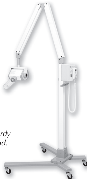
Corix Pro 70 Mobile Stand, DTP61300

Mobile Stand, on a sturdy and stable rolling stand.